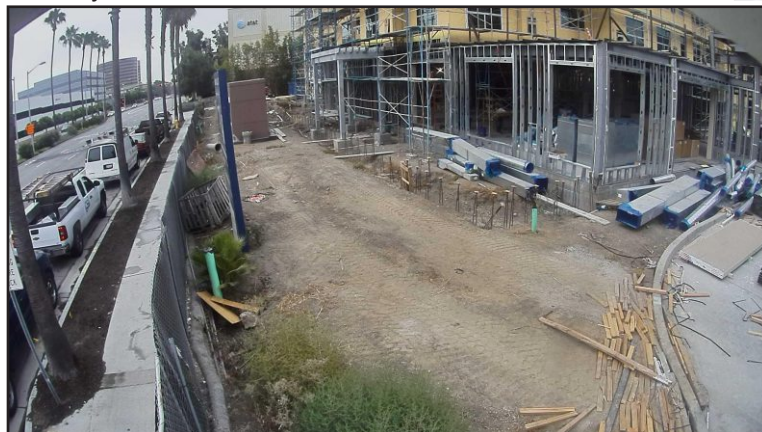
Hotel (10 stories)