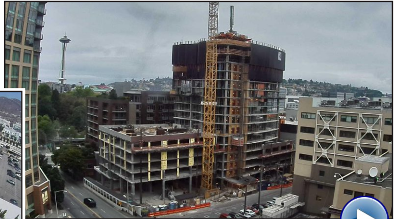
High-Rise (42 stories)