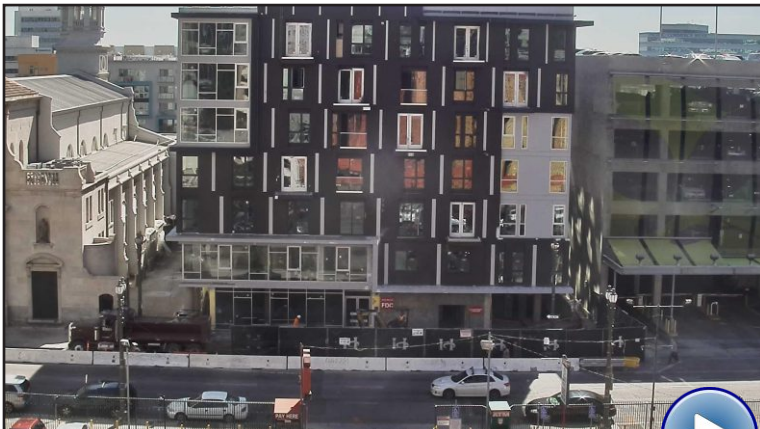
Mid-Rise (7 stories)