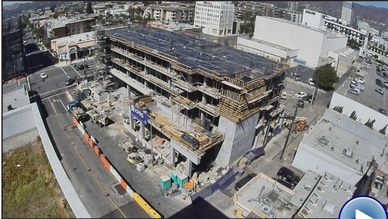
Hotel (10 stories)

With RTIS, Live Video Broadcasting your projects can be viewed in “real-time” from our desktop, web, video wall, tablet or smart phone apps.