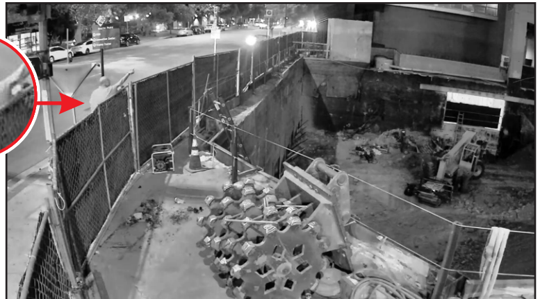
High-Rise (30 stories)